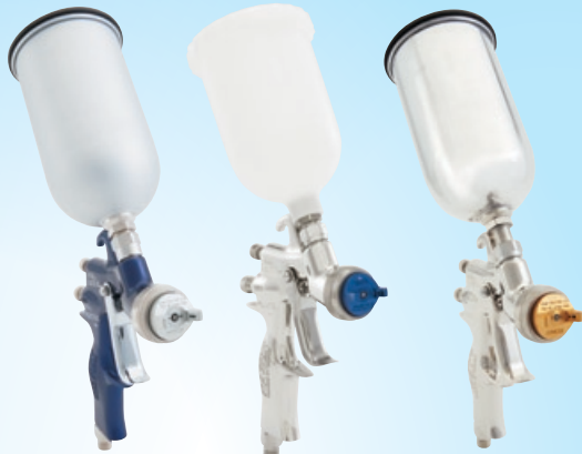
HVLP Primer HVLP Waterborne Base Coat LVL Clear Coat

When considering a complete gun system, the Razor product line has a primer, base and clear solution for all your automotive paint spraying needs.